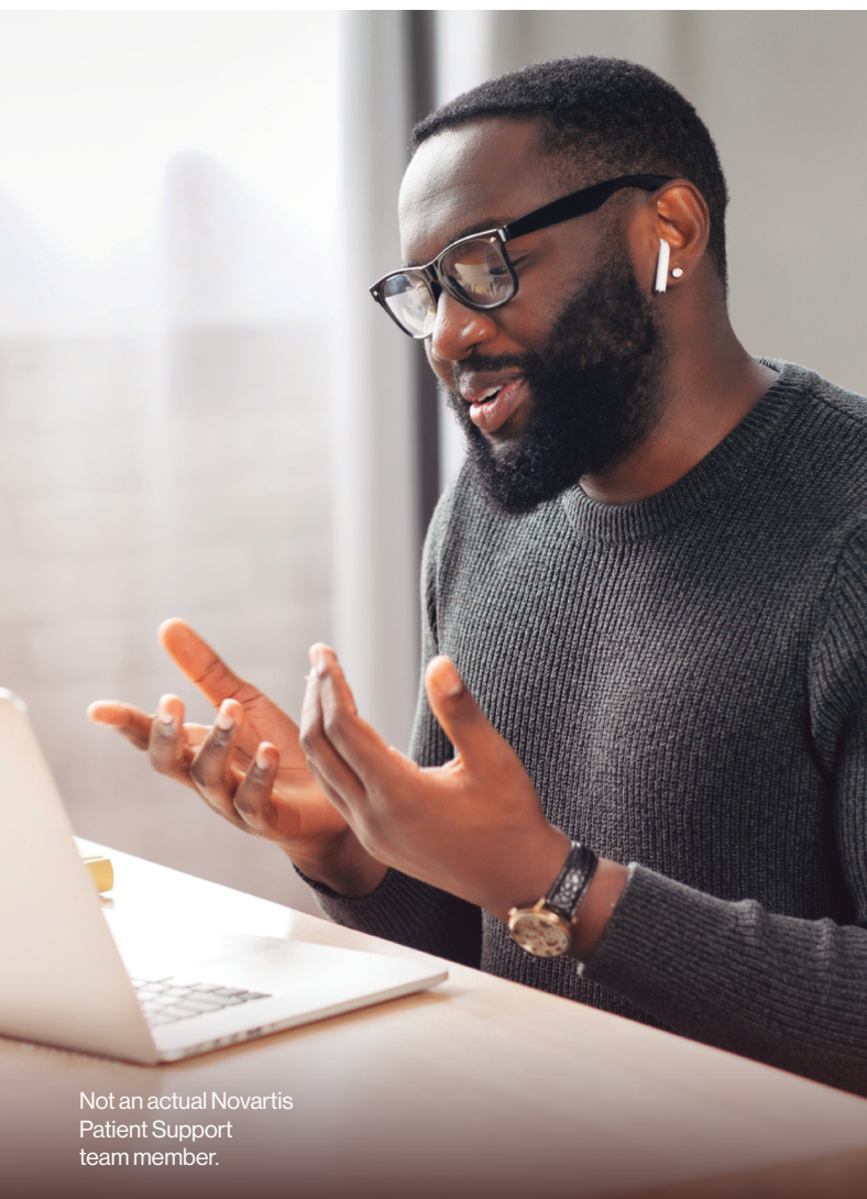
Not an actual Novartis Patient Support team member.

Trying to understand insurance terms can feel like learning a different language. Read on for a breakdown of common terms that may come up.